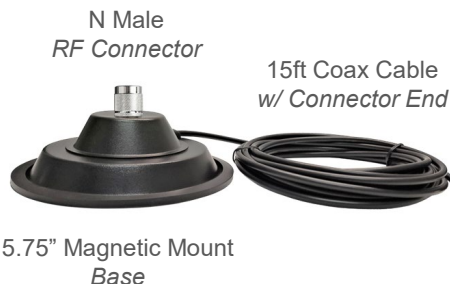
5.75" Magnetic Mount Base