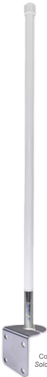
AG12B-NF L-Bracket Mount

AG12M-15-SM: Cellular 4G 5G Magnetic Mount Antenna w/ 15ft Coax Cable – SMA Male AG12M-15-FF: Cellular 4G 5G Magnetic Mount Antenna w/ 15ft Coax Cable – FME Female AG12M-15-TM: Cellular 4G 5G Magnetic Mount Antenna w/ 15ft Coax Cable – TNC Male AG12M-15-NF: Cellular 4G 5G Magnetic Mount Antenna w/ 15ft Coax Cable – N Female AG12M-15-FAKRA: Cellular 4G 5G Magnetic Mount Antenna w/ 15ft Coax Cable – FAKRA