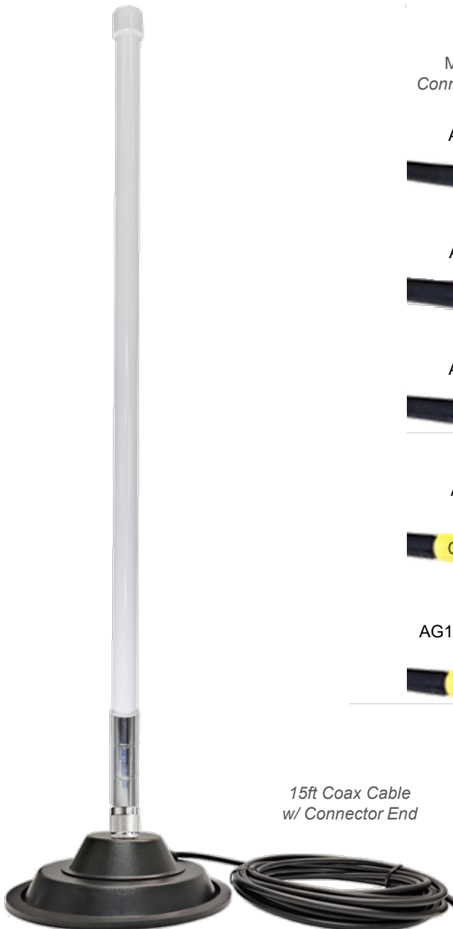
AG12M Magnetic Mount