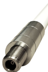
N Female Base RF Connector