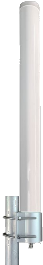
Mounting Pole Not Included