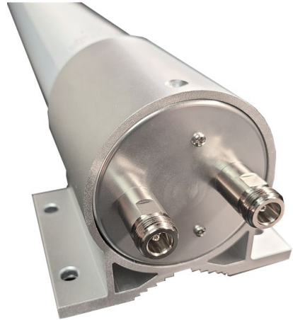
2 x N Female Connectors