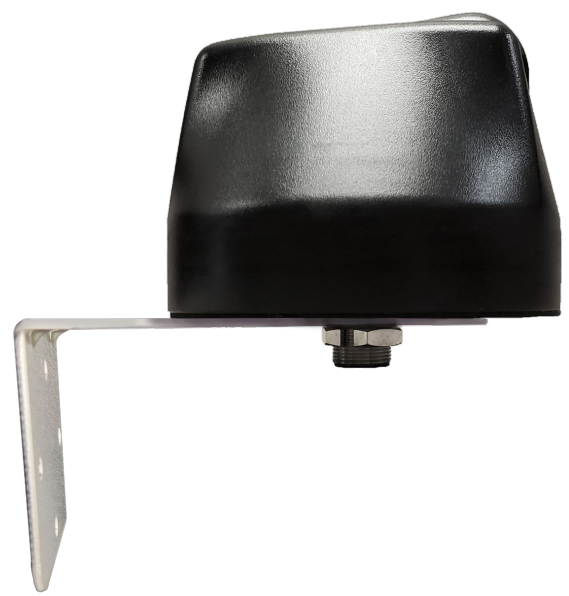
AG60 Enterprise Series Antenna w/ Optional L-Bracket Mount L-Bracket Sold Separately