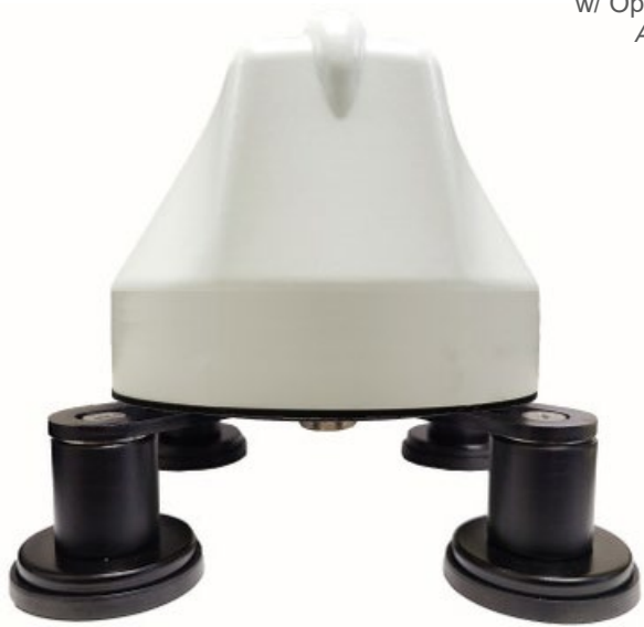
AG60 Enterprise Series Antenna w/ Optional AG-Lander Mag Mount AG-Lander Sold Separately