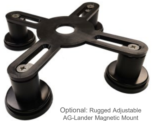
Optional: Rugged Adjustable AG-Lander Magnetic Mount Sold Separately