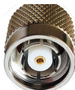
RP TNC Male Direct Connect Base