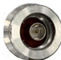
N Male Direct Mount Base