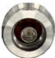
N Male Direct Connect Base