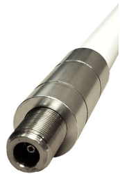
N Female Base RF Connector