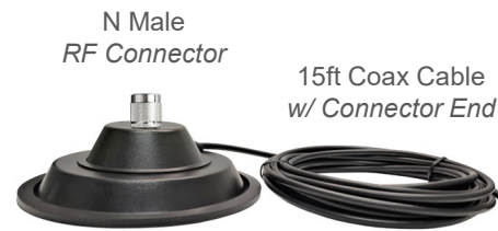
5.75" Magnetic Mount Base